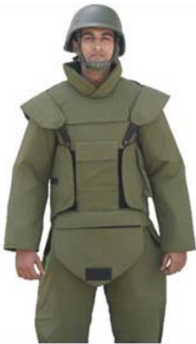
Certified to Mil-Std-662F & STANAG - 2920

The format allows enclosure of a DIN-A4 (letter format) envelope with a thickness of approx 0.45mm (for bigger size of parcel we are offering Bomb Suppression Blanket).