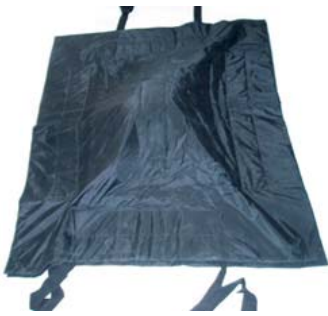
Certified to Mil-Std-662F & STANAG - 2920