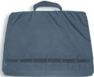
Certified to Mil-Std-662F & STANAG - 2920

The multiple layer ballistic filler is enclosed in an outer cover, which is fitted with lifting straps. Both blanket and ring fold into a compact, easily carried bag.