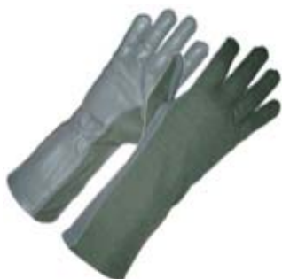
Available in Tan and Sage Green