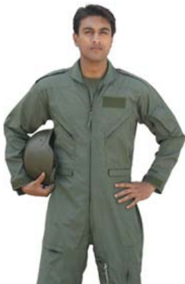
Available in Tan and Sage Green

For extra protection on the chest the suit can be supplied with a hard armour plate in 10 by 12 inches size, which corresponds to NIJ level III or IV depending on user requirement.